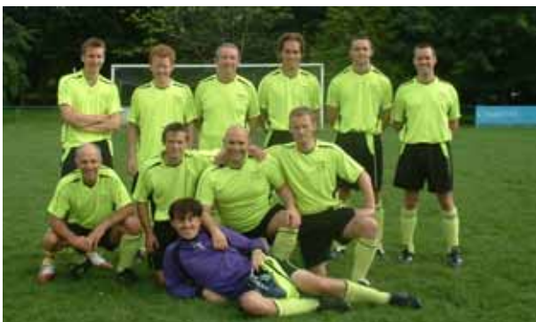
Fair play—the QE Staff and Year 11 Boys football teams.